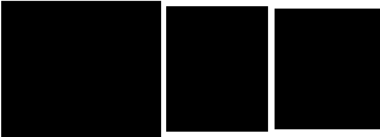
Figure 1 (a): Possible absorption pathways of a medicine administered into the eye [2]