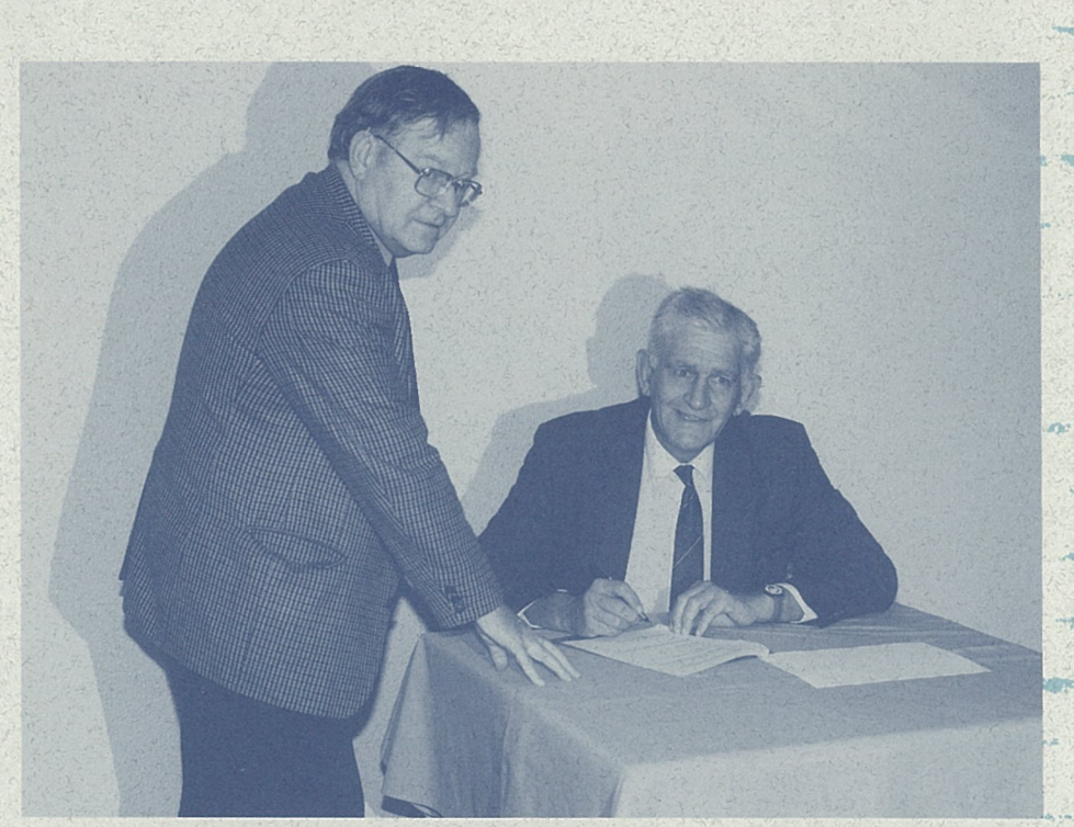
Signing of the memorandum of understanding. See page 9 for details