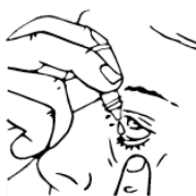
Diagrams 2 and 3