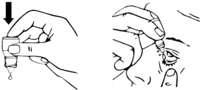
Diagram 2 and 3