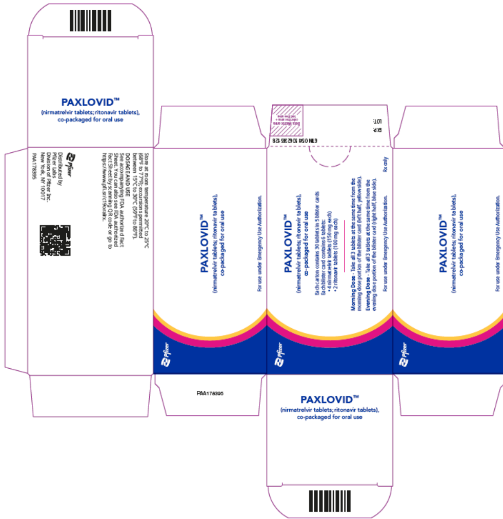
Figure 2 - Artwork for carton that will initially be supplied in New Zealand

The table below highlights the differences between the International PAXLOVID artwork and the NZ Pack.