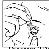
Diagram 2 Diagram 3